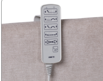
Handheld Control System