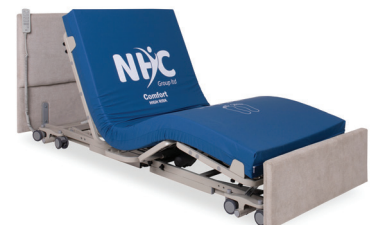
Adjustable Backrest and Leg Rest