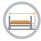
INTEGRATED BED EXTENSION