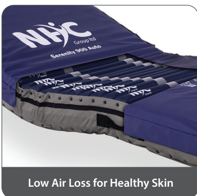
Low Air Loss for Healthy Skin