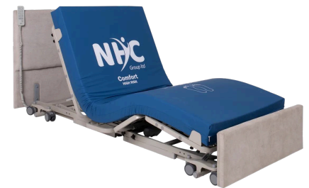
Adjustable Backrest and Leg Rest