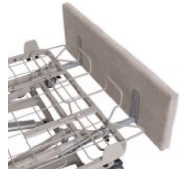
100mm Bed Extension