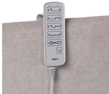
Handheld Control System