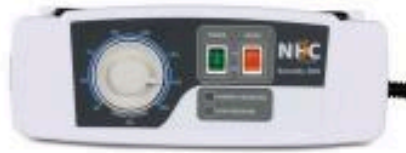
User-Friendly Analogue Pump