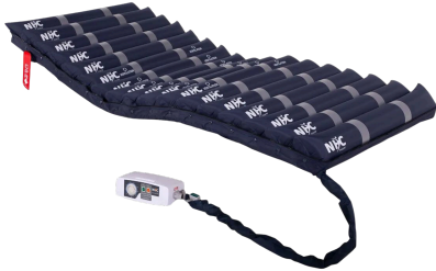
17 Cell Design