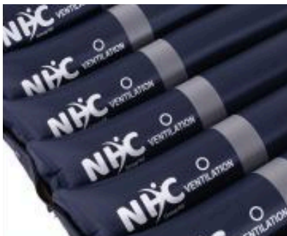
Low Air Loss