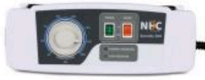
User-Friendly Analogue Pump