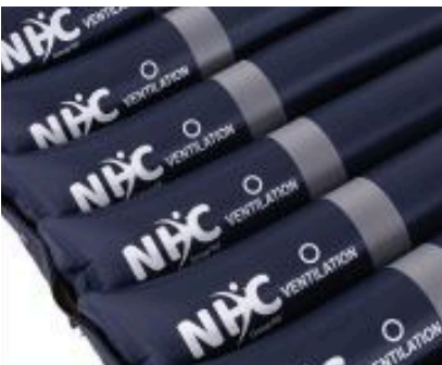
Low Air Loss