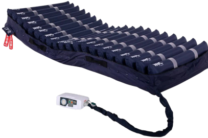
20 Cell Design