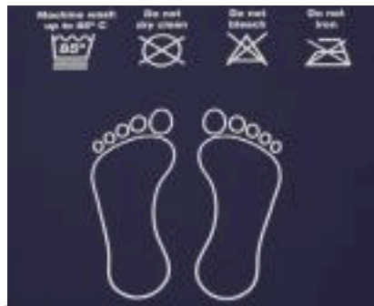
Antimicrobial, Vapour- Permeable Cover