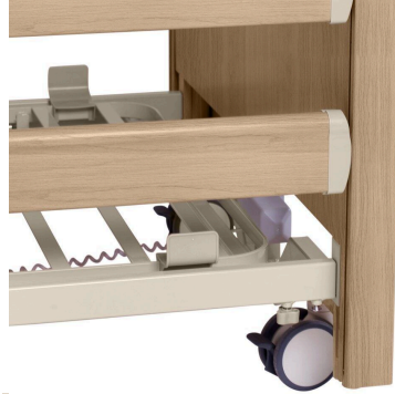
Rail Height Regulation Compliant