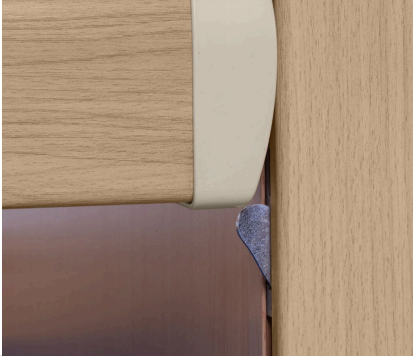
Hand Paddle for Side Rails