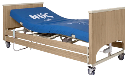
Adjustable Back and Leg Rest