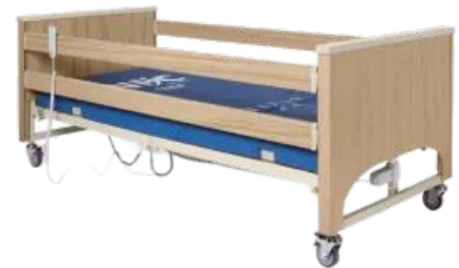
Bed Extension Option