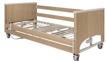
Adjustable Side Rails