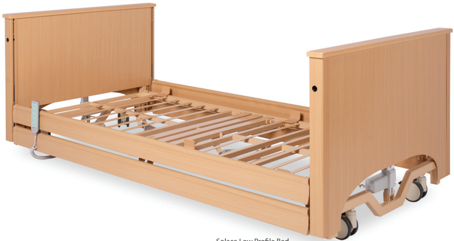
Solace Low Profile Bed